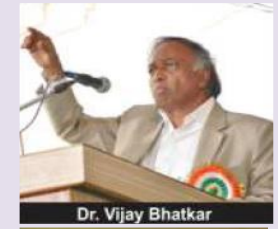
Dr. Vijay Bhatkar