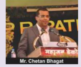
Mr. Chetan Bhagat