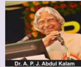
Dr. A. P. J. Abdul Kalam