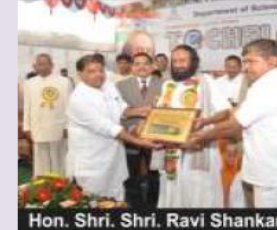
Hon. Shri. Shri. Ravi Shankar